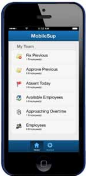
My Team: Supervisors can display their team and perform group-related functions.

The My Team area can filter and display lists of employees available to work, previous period time cards needing approvals, approaching overtime and so on. My Team provides group functions such as: