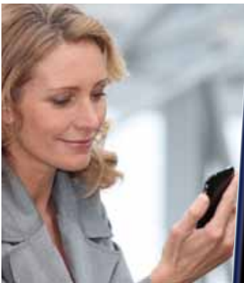
Supervisor is notified that an employee is late.