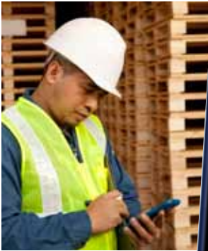
My Tasks: Each supervisor sees their own to-do list of tasks.